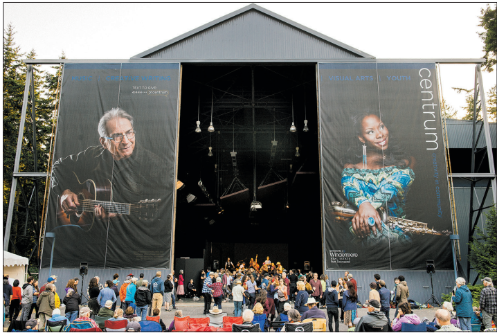
Arrive early and buy lunch on the green before afternoon Pavilion concerts!