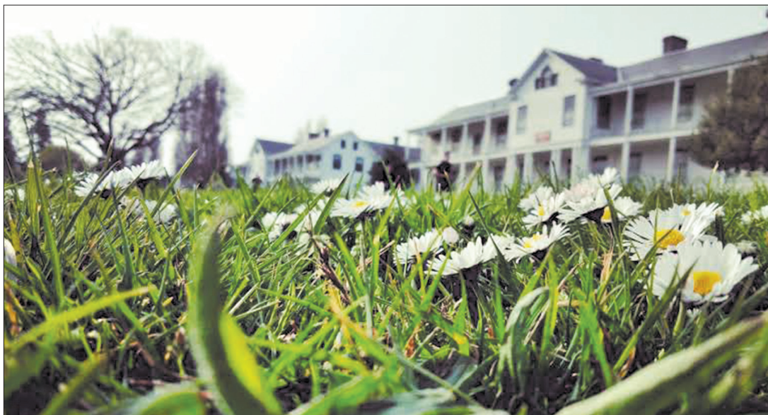
Enjoy, learn and create this summer in beautiful Fort Worden State Park.

Hailed by NPR as a "literary badass" and a "master storyteller with a rock and roll heart," Luis Alberto Urrea is a prolific and acclaimed writer who uses his dual-culture life experiences to explore greater themes of love, loss and triumph. A 2005 Pulitzer Prize finalist for nonfiction and member of the Latino Literature Hall of Fame, Urrea is the critically acclaimed and best-selling author of 16 books, winning numerous awards for his poetry, fiction and essays. Born in Tijuana to a