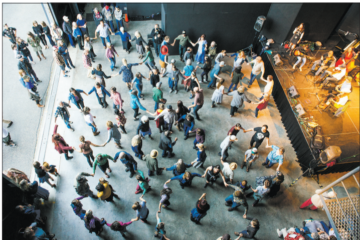
Nothing says summer in Port Townsend like a concert at the McCurdy Pavilion and dancing the night away.